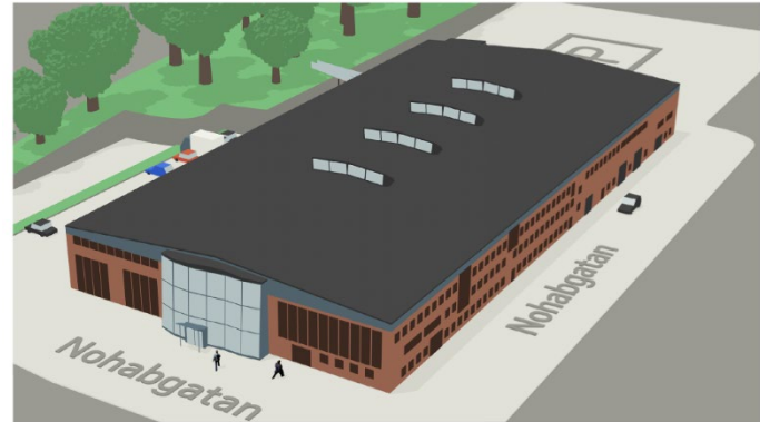
Production Technology Centre (PTC)