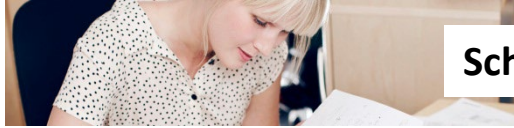
School of Business, Economics & IT