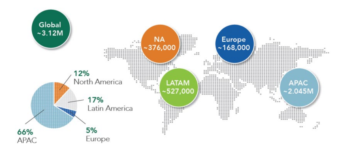
Figure 2: The global gap in the cybersecurity workforce

critical infrastructures, and consumer products. Furthermore, all manufacturing companies will need to comply to ensure consumer products safety, data privacy, etc. In summary, the employment figures for cybersecurity are high and are expected to grow significantly in the coming years due to the increasing demand for cybersecurity professionals and the shortage of skilled workers in the field.